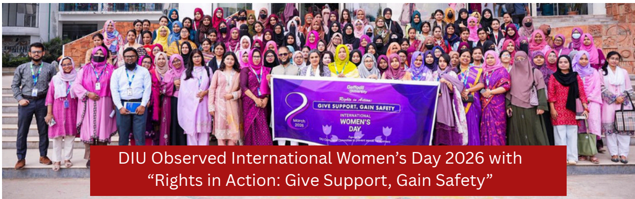
DIU Observed International Women’s Day 2026 with “Rights in Action: Give Support, Gain Safety”

Daffodil International University observed International Women’s Day 2026 through a program titled “Rights in Action: Give Support, Gain Safety,” organized by the Complaint Committee to Prevent Sexual Harassment, where students, faculty, and staff participated in a rally and discussion session emphasizing dignity.